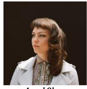
Angel Olsen My Woman

Classic "room" reverb on drums, sublime chanteuse. Someone called this an "artrock fever dream". Not far off actually. Kind of hard to dislike songs that make the world around you look like one big Polaroid color negative transfer. There's a Portishead conection, our spies are telling us.