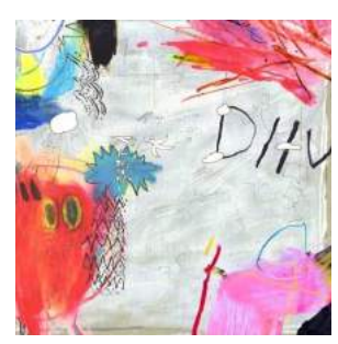
DIIV Is the Is Are

DIIV are Brooklyn youngsters who found a soft spot I didn't know I had, somehow managing to make me nostalgic for high school. I'm hearing the youthful dreampop that you need long hair covering your eyes to completely understand and melodies that recall WLIR's Screamer of the Week. No complaints: my sweet tooth isn't rotten just yet.