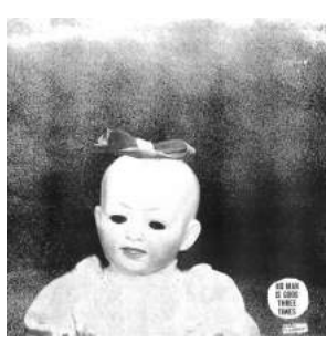
Ty Segall Emotional Mugger

Japan's taught me to despise ranking things best to worst (annoying pastime over here) but gun-to-head, this'd be near the top. If art is meant to arouse memories and emotion. then this is art. Listened on repeat from a passenger seat, Kobe to Okayama and back. I'd have been happy on the highway for days n' days.